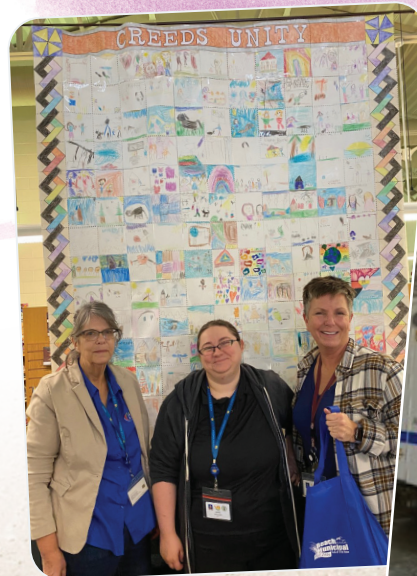
Creeds Library during National Library Week; Celebrating EMS Week with Chesapeake Beach Volunteer Rescue Squad

Beach Municipal visited several city offices and school departments this spring with tokens of appreciation, thanking all for their service to the Virginia Beach community!